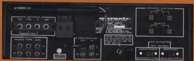
Rear view: Marantz Model 2015 Stereophonic Receiver (30 Watts Continuous)