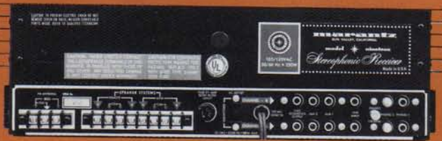
Rear view: Marantz Model 19 Stereophonic Receiver (100 Watts Continuous)

14¼" x 4¾" x 12", 23 lbs., shown with optional WC-10 walnut cabinet