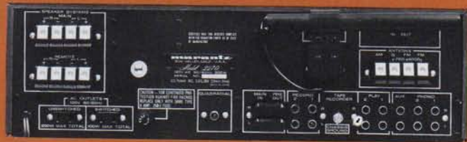
Rear view: Marantz Model 2270 Stereophonic Receiver (140 Watts Continuous)