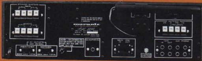
Rear view: Marantz Model 2245 Stereophonic Receiver (90 Watts Continuous)