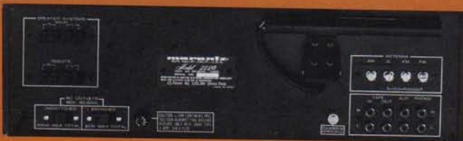
Rear view: Marantz Model 2220 Stereophonic Receiver (40 Watts Continuous)