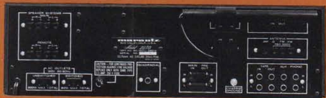
Rear view: Marantz Model 2230 Stereophonic Receiver (60 Watts Continuous)